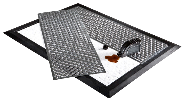
Mat with inlay for exchangeable absorber fleece with metal foot plate