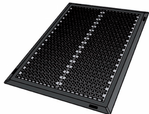
Mat with inlay for exchangeable absorber fleece with metal foot plate