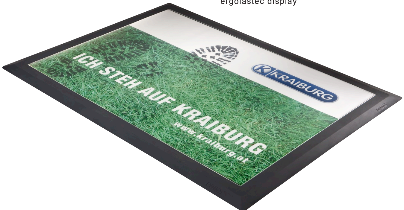
Mat with transparent display insert for posters