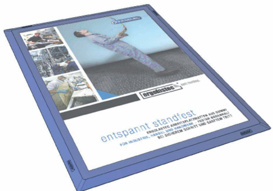
Mat with transparent display insert for posters